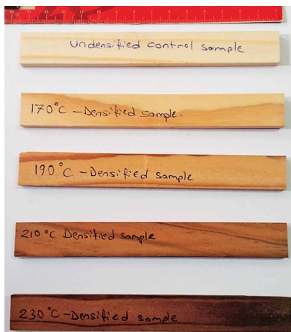
Figure 1 Undensified control specimen and heat-treated/densified specimens

was 2 min (30 s closing, 60 s pressing and approx. 30 s cooling). The densification of wood occurred only on the side in contact with the heated platen (Figure 1). The surface roughness and wettability measurements were performed on the surface exposed to the hot platen during the densification. Before the experiments, the treated lamellae were conditioned in a climate room with relative humidity of 65 % and temperature of 20 °C until a constant mass.